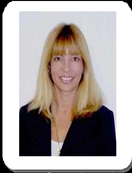
Ms. Sangi Blair Criminal Justice Award