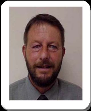
Mr. Jim Donnan Juvenile Justice Award